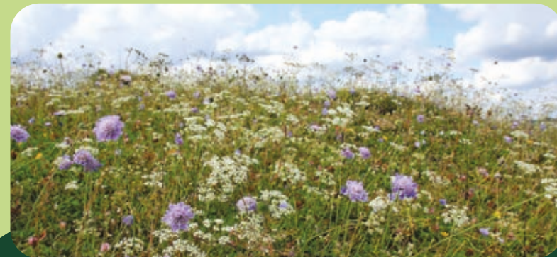
Small scabious at Gang Mine

Thank you for helping keep our reserves great places for people and wildlife to enjoy, now and in the future.