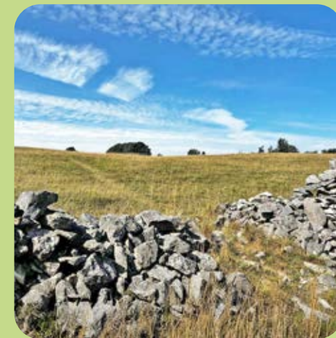
Middleton Moor