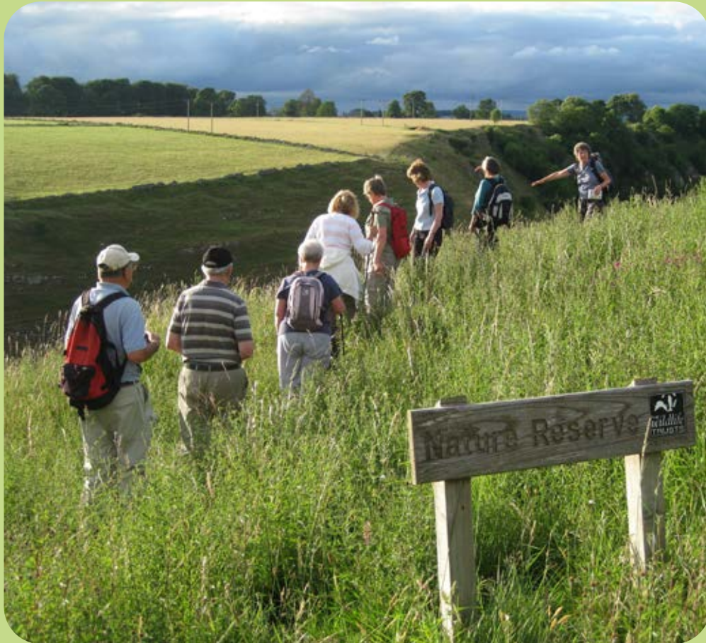
Walkers at Deep Dale

Take a trip to one of our nature reserves and discover the wonderful wildlife on your doorstep.