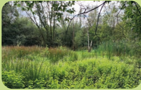
Wet Woodland at Rowsley Sidings