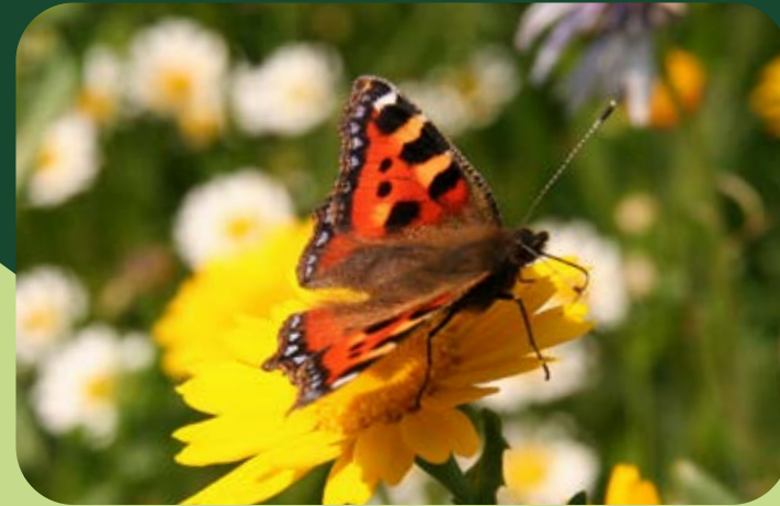
Small tortoiseshell on wildflowers