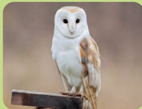
Barn owl at Erewash Meadows

Part of the largest area of floodplain grasslands and wetlands in the Erewash Valley – great for bird watching and water voles.