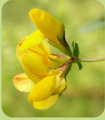
Bird's-foot trefoil found at Hartington Meadows

From woodlands to wetlands, stunning open spaces to hidden gems, discover our best sites for nature across Derbyshire.