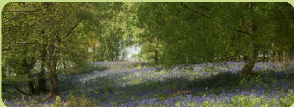
Spring Wood bursting with bluebells

With flower-rich grasslands and a small pond providing important habitat for amphibians.