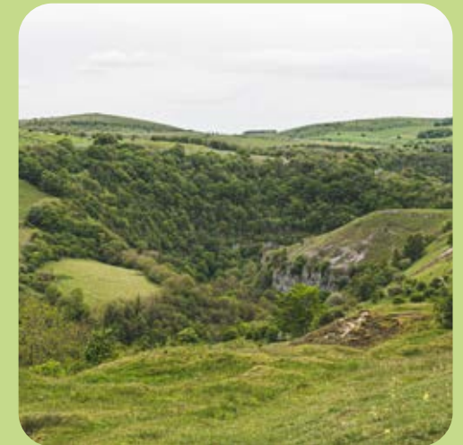
Priestcliffe Lees