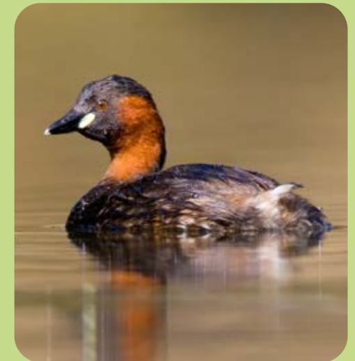
Little grebe – found at Cromford Canal

This small reserve is part of an ancient lead mining area. Explore and look for specialist lead-tolerant flowers and glow worms!