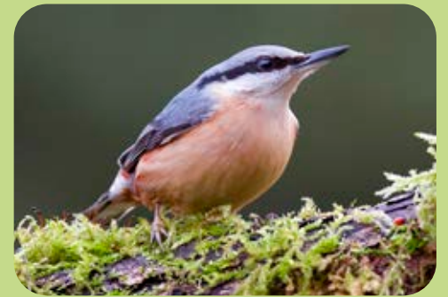
Nuthatch at Mapperley Wood

A small reserve with over 150 plants, including cowslips and some scarce ones.