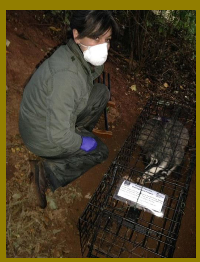
Post vaccination healthchecks

a national badger vaccination programme, modelled on our own in Derbyshire, is the alternative to the badger cull.