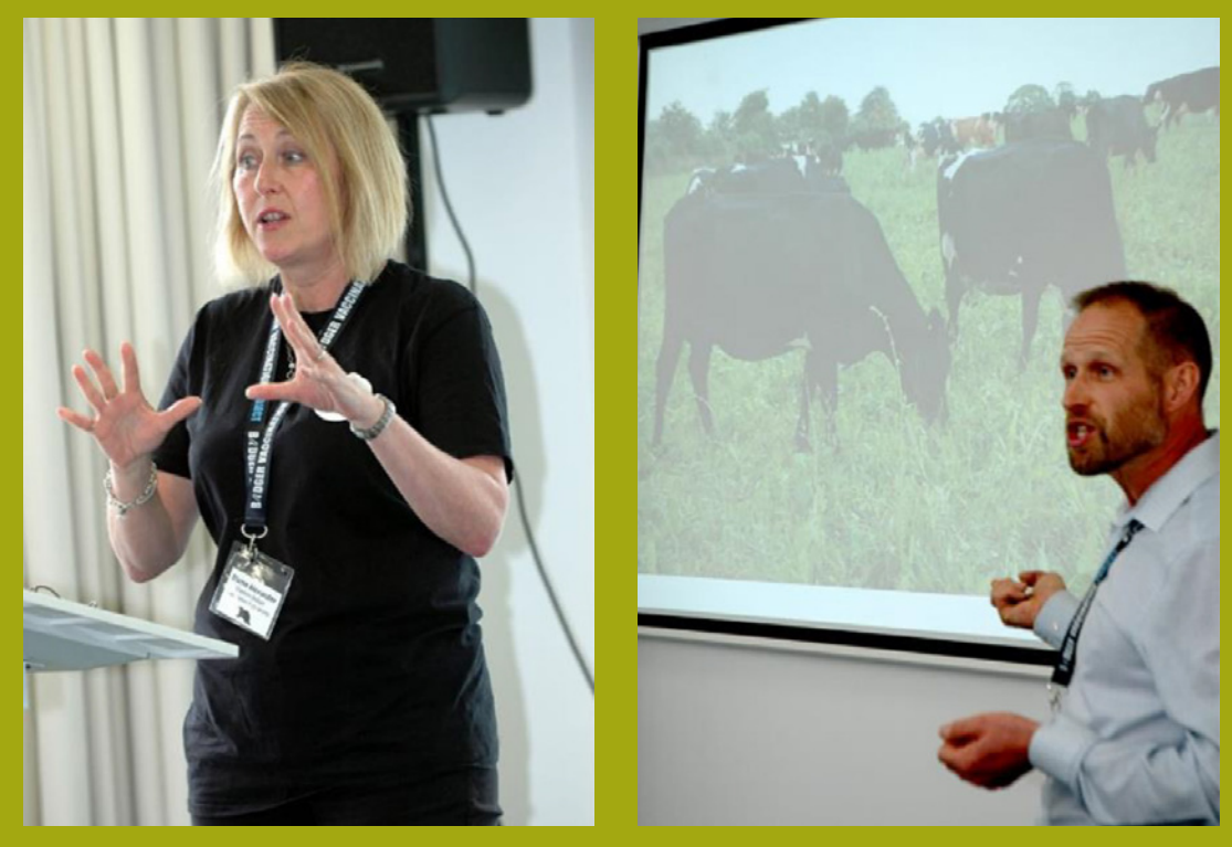
Speakers representing vaccination projects and the farming community