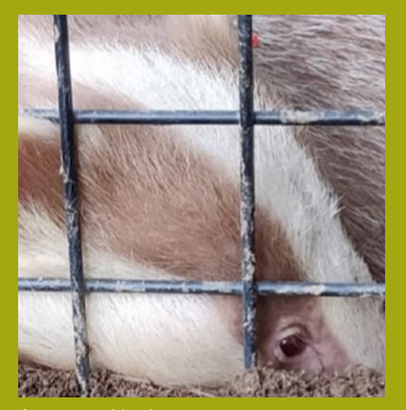
An unusual badger.