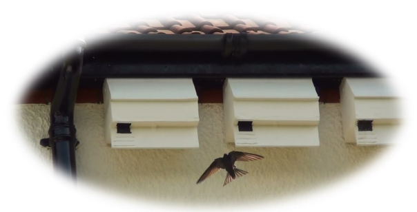
External nest boxes

When building new houses install internal swift bricks.