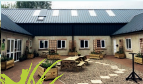
Our Middleton HQ