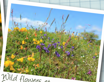
Wild flowers at Gang Mine Kieron Huston