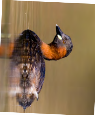
Little grebe found at Cranford Canal