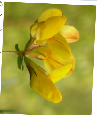
Bird's - foot trefoil found at Hartington Meadows