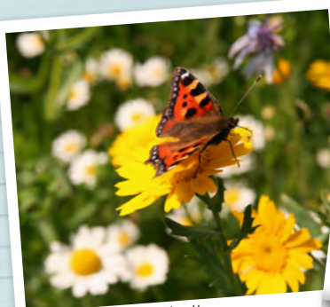
Small tortoiseshell on wild flowers Kieron Huston

Take a trip to one of our nature reserves and discover the wonderful wildlife on your doorstep.