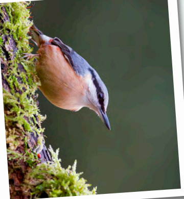
Nuthatch at Mapperley Wood