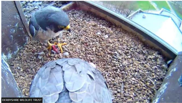
DERBYSHIRE WILDLIFE TRUST

The peregrines have been nesting at the cathedral since 2006